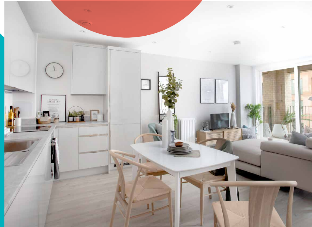
Photography of show apartment at Colindale Gardens

More great Rent to Buy homes coming soon. Visit rent-to-buy.co.uk for updates